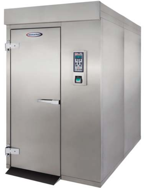
Chilling Capacity Freeze Capacity 160°F-38°F 160°F-0°F (90 mins) (120 mins) (4 hours)